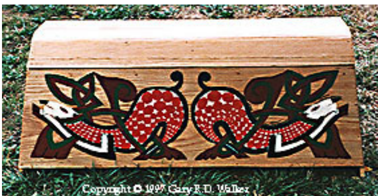
This one was an ice chest.

Records from the 1990s are sketchy. We have pictures of prizes but no clear indication of which contests they were for or what year they were awarded, but the workmanship continued Adiantum's word fame as the provider of the best tourney and competition prizes!