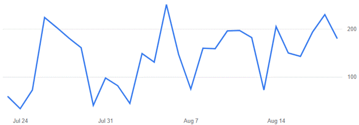
Active Members Per Day (Jul 23 - Aug 19)