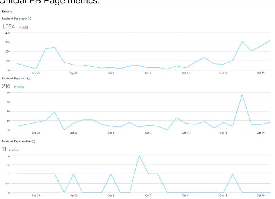
Official FB Discussion Group metrics:

Social Media, Murchadh Monaidh Chroaibhe: Social Media status: Facebook Page and Official Discussion Group have been monitored daily, with events and mandatory postings submitted as requested. No violation of SCA/An Tir Social Media policies noted. Official FB Page metrics: